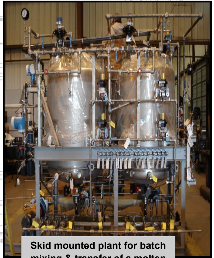
Skid mounted plant for batch mixing & transfer of a molten liquid